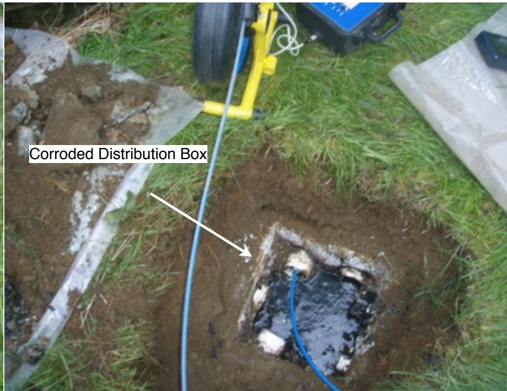
Corroded Distribution Box