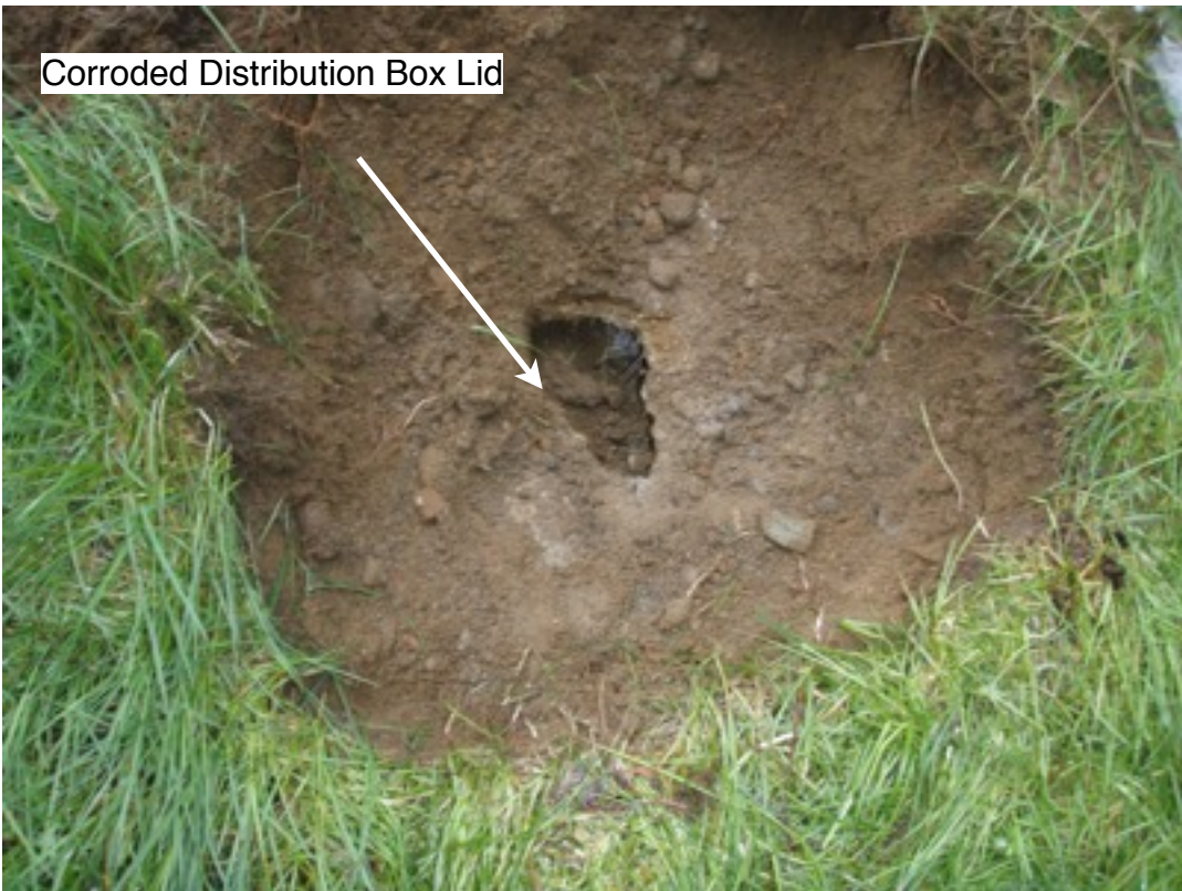
Corroded Distribution Box Lid