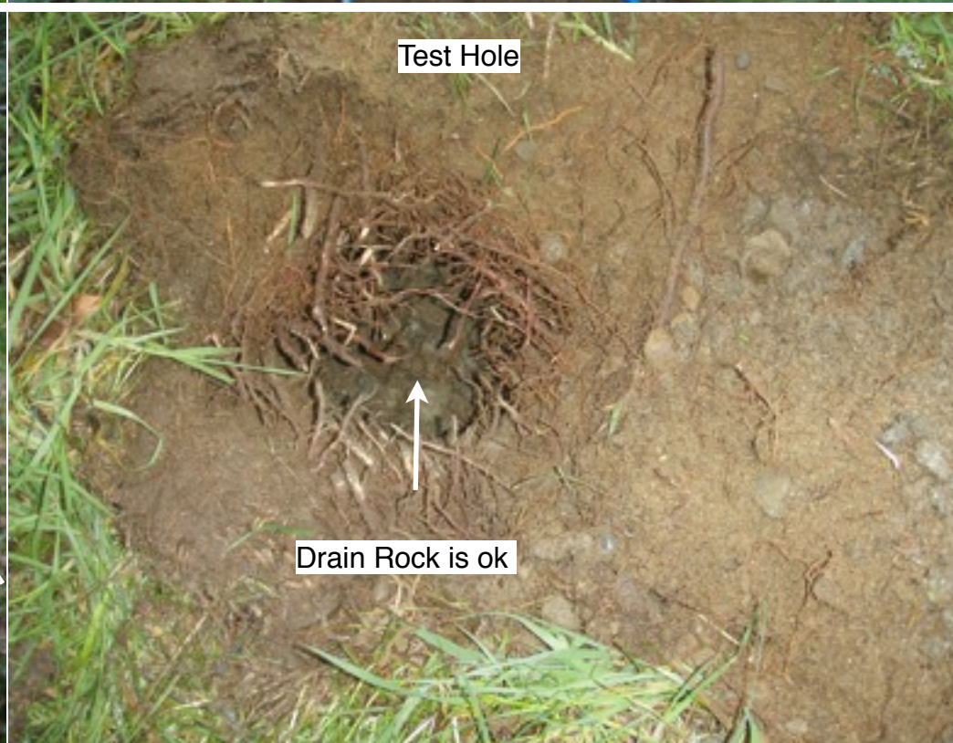
Drain Rock is ok